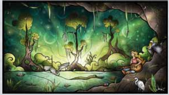
EXHIBIT AND EVENT PUBLICITY

Works will be auctioned online on August 29, 2015, on the 10th Anniversary of Katrina. The creation of several additional works will extend beyond the August 29 event, with resulting art to be auctioned live online during the East St. Tammany Habitat for Humanity's Home Is Where the Art Is gala in November of 2015.